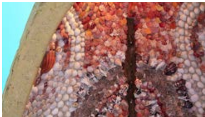
Teresa Busuttill, Asleep with the Fishes (2023), dimensions variable, mixed materials. Installation view at firstdraft