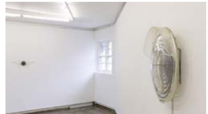
Shaye Dương, Telesm (2022), dimensions variable, mixed materials. Installation view at firstdraft