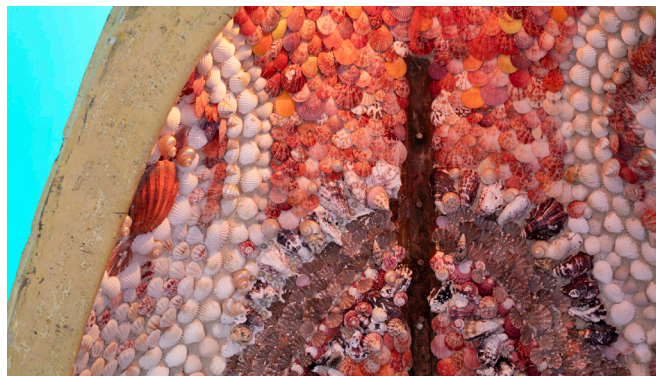
Teresa Busuttill, Asleep with the Fishes (2023), dimensions variable, mixed materials. Installation view at firstdraft Photography by Jessica Maurer.