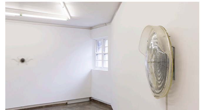
Shaye Dương, Telesm (2022), dimensions variable, mixed materials. Installation view at firstdraft